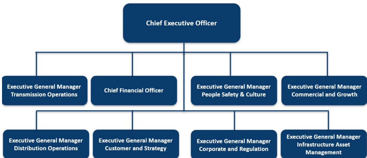
Figure 5.1: AGIG - Organisational Structure as at May 2026

The functions shown above provide corporate management and administration services, including IT and marketing services to both the scheme and non-scheme networks in each of the states in which the AGIG group operates including AGN's separate non-scheme pipelines in Queensland and New South Wales.